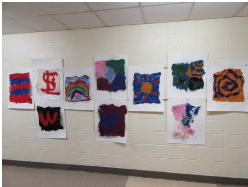
Felting work at St. Margaret of Scotland, 2017